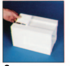
2. Locate top and bottom trim panels in recessed area of column quarter with grooves nearest ends of column section.

For 6°, 8° and 10° columns, the exposed surface area of trim panels should be the same as width of column side panel. For this measurement, plus cap or base height, refer to dimension in chart below.